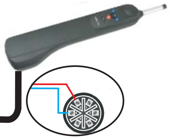
Furuno Power/Data Lead