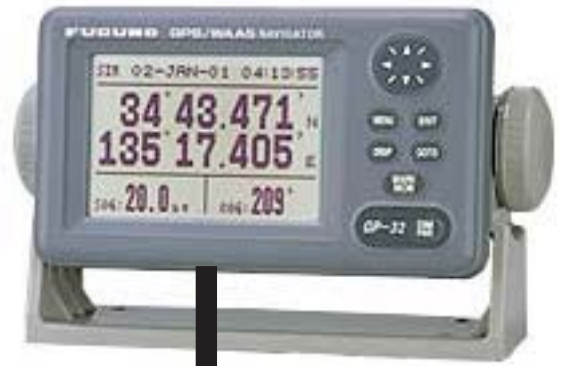
Furuno GPS 32